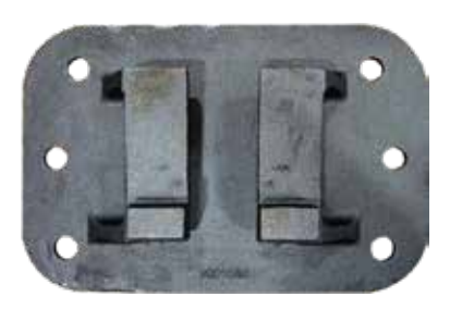
LG SA FEMALE WEDGE BRACKET PN: 32-17332

WORKMASTER's WEDGE MOUNT CRADLE LUG BRACKET is the highest quality mount available. The Bracket's heavy-duty, cast steel construction, and the Easy Grip, Bolt-On Side Handle makes it a fast, easy and log lasting solution to move the Vibrator Assembly from Pocket-to-Pocket.